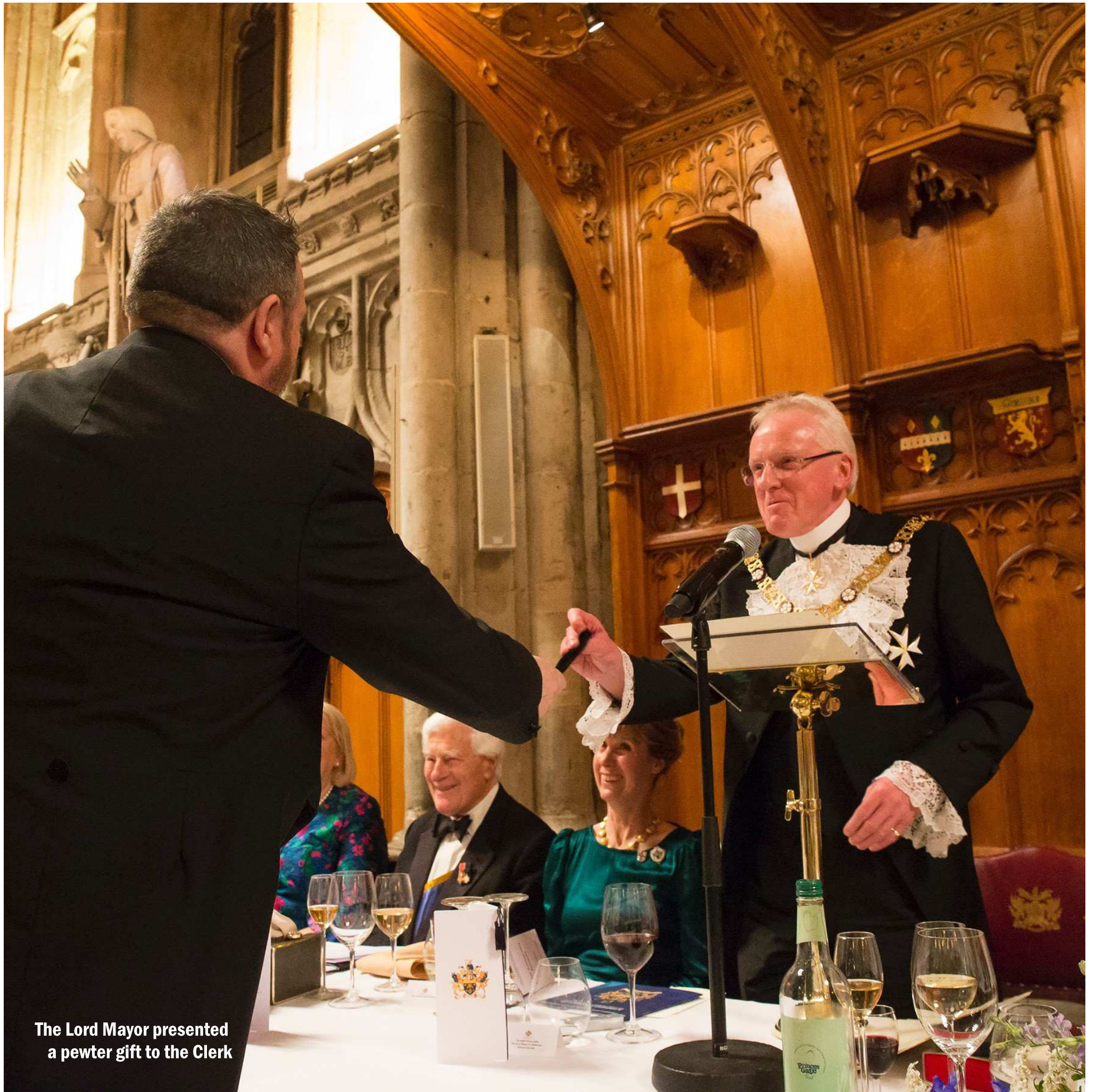
The Lord Mayor presented a pewter gift to the Clerk